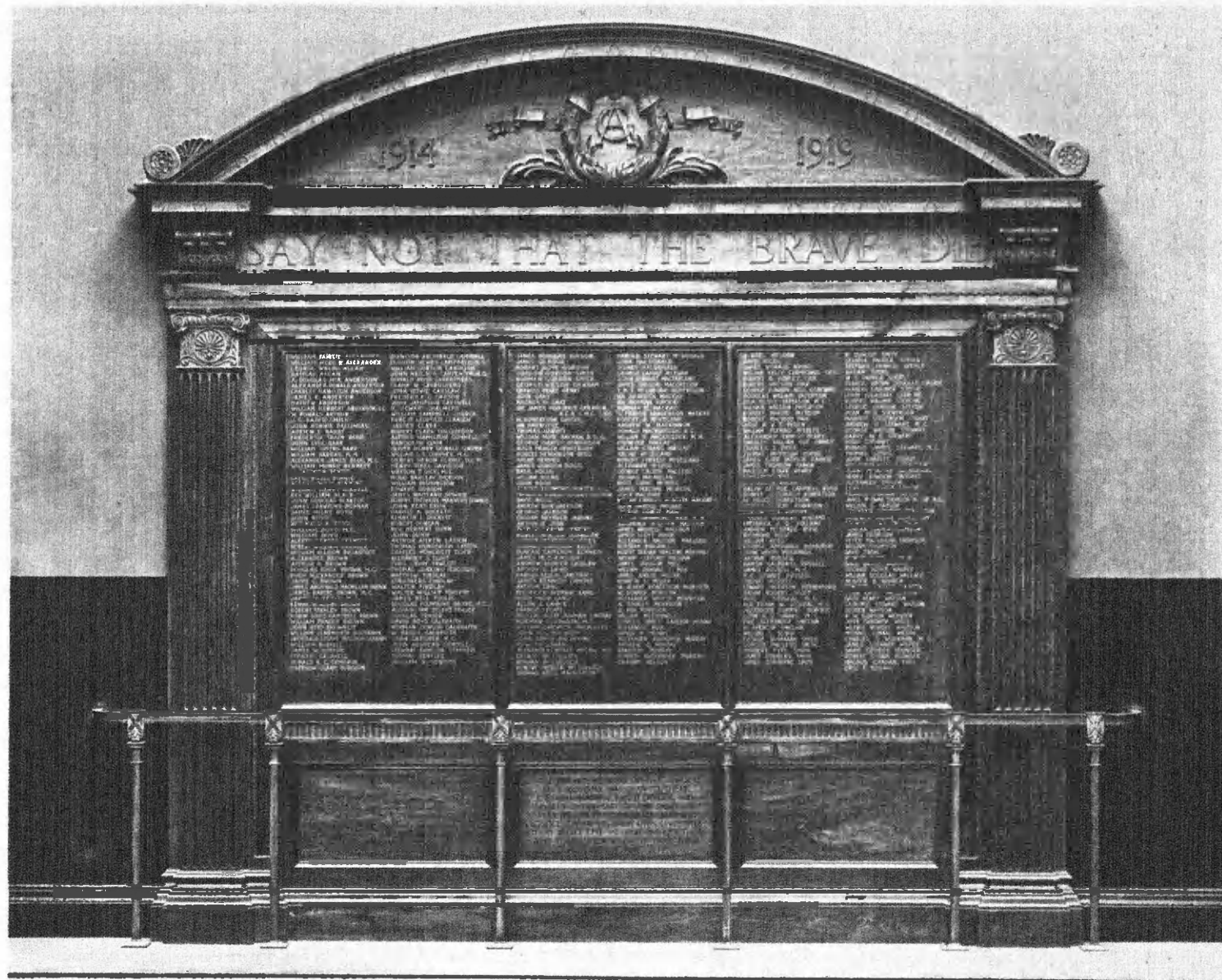
THE ROLL OF THE FALLEN