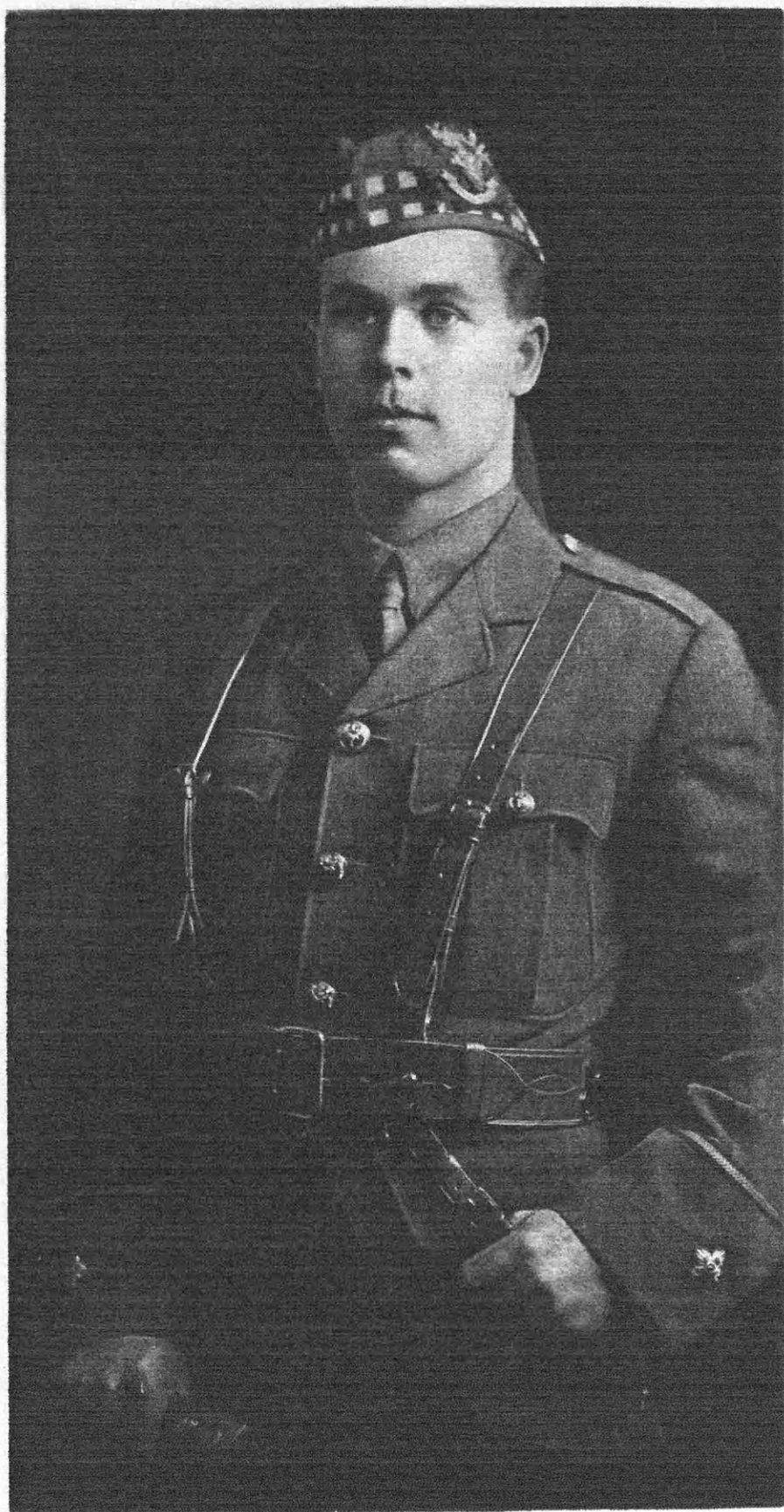
LIEUTENANT DONALD MACKINTOSH V.C. SEAFORTH HIGHLANDERS KILLED IN ACTION 11TH APRIL 1917