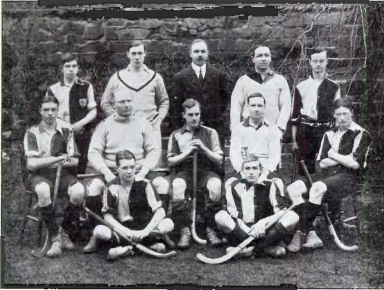
HOCKEY TEAM 1913.