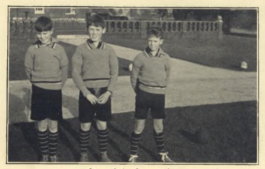
Some of the Soccer side.