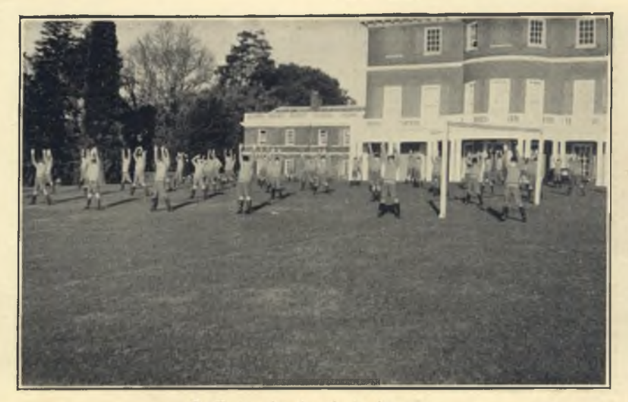
P. T. in the break in January.