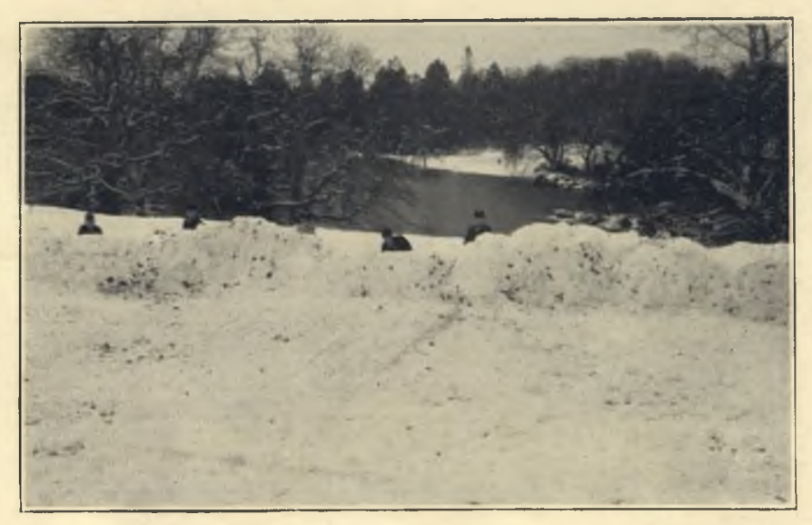
February-the great Fort.